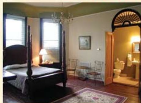
◀ Deluxe Queen