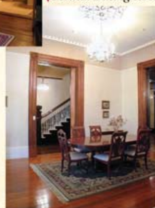
▼ Formal Dining Room